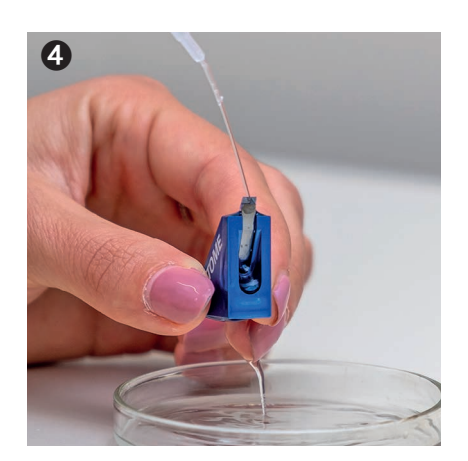
Rince with 100% ethanol.