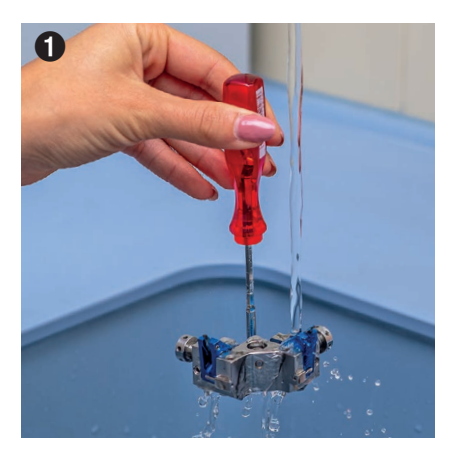
Remove the knife stage from the cryo chamber, leave the knives in the stage, wash under tap water for warming up.

This procedure serves for the cleaning of our cryo immuno and cryo 25° knives . We are at your disposal for any further assistance you might require.