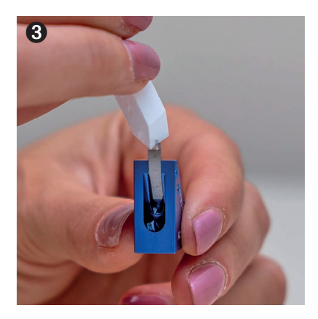
Clean the knife with 15% ethanol, keep wet.