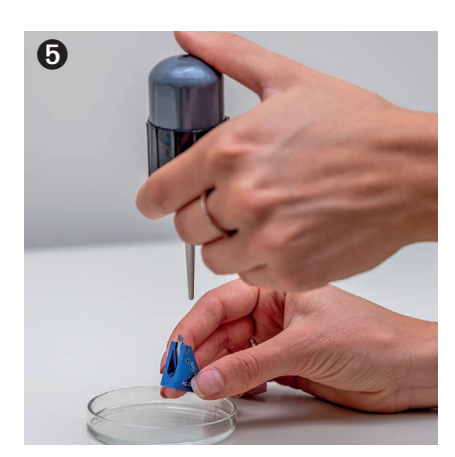
Dry with a dustblower or canned air.

Diatome Ltd Helmstrasse 1 · CH 2560 Nidau / Switzerland Phone +41 (0)32 332 91 13 diatome@diatome.ch · www.diatome.ch